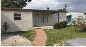
2721 NW 6th Ct

MLS#: F10076198 Status: CS Price: $179,900 SqFt: Beds: 3 Bath: 2 (2 0) 1000 NW 23rd Ter