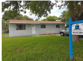
2851 NW 8th St

MLS#: A10302127 Status: CS Price: $168,000 SqFt: 1,204 Beds: 3 Bath: 2 (2 0)