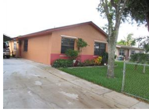
2860 NW 8th St

MLS#: F10108008 Status: CS Price: $173,000 SqFt: Beds: 3 Bath: 2 (2 0)