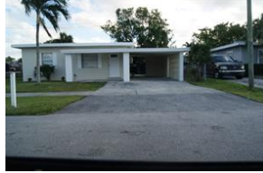
2626 NW 10th St

MLS#: A10467317 Status: CS Price: $182,000 SqFt: 1,302 Beds: 3 Bath: 2 (2 0)