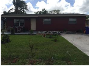
2910 NW 8th St