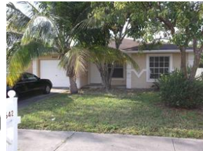
2642 NW 9th Ct

MLS#: A10244444 Status: CS Price: $170,000 SqFt: 1,636 Beds: 4 Bath: 2 (2 0)